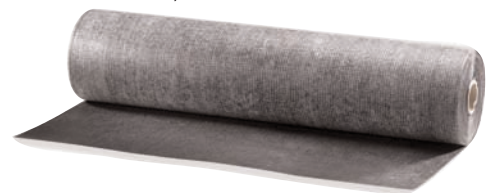
GlasPave25 is available in roll lengths up to 3,000 ft making installation fast and easy.

The additional stiffness of GlasPave25, compared to paving fabrics and other paving mats, makes it more durable and less prone to on-site installation damage.