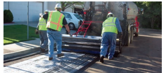
GlasPave25 is easy to install and does not shrink like conventional paving fabrics.

other paving mats. The higher strength helps extend pavement life by delaying reflective cracking which is a common contributor to costly repairs and the eventual failure of asphalt overlay applications.