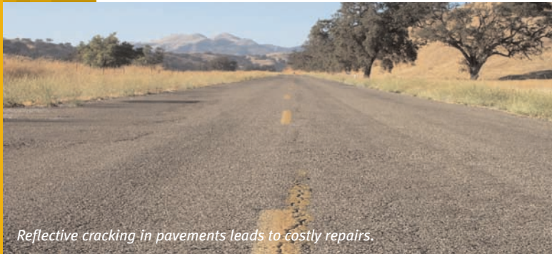
Reflective cracking in pavements leads to costly repairs.

With roll lengths of 750 ft and 3,000 ft, GlasPave25 installs with fewer roll changes when compared with bulkier, shorter products. GlasPave25 is available in two roll widths (46 or 78.75 in.), which makes for easier placement around corners and curves.